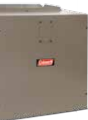
Modular air handler (MX-MV)