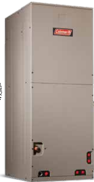
Single piece air handler (AHE-AHV) with evaporator