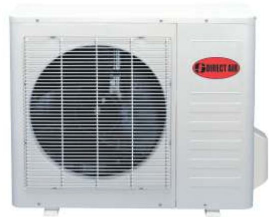
Compact and quiet outdoor unit